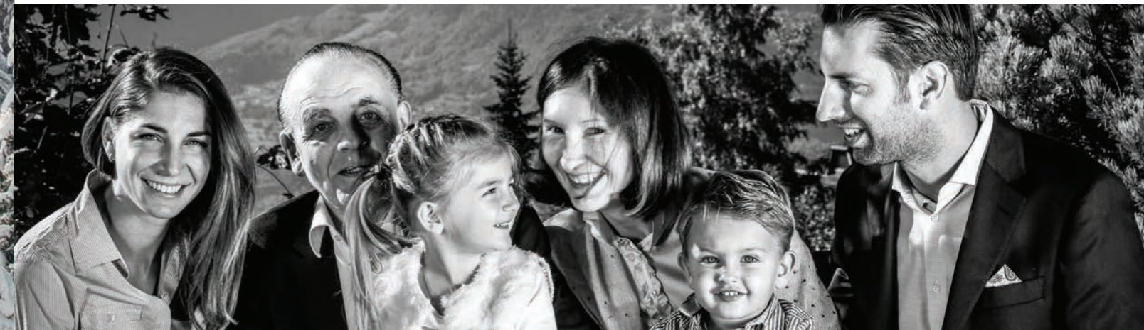
Three generations of the Méan family